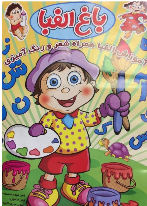
Figure 3. Farsi children's book. I came across a children's book in Farsi in a Farsi language class that my five-year-old son recently started attending on Sundays.