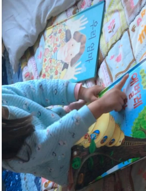
Figure 2. Korean books. My two-year-old daughter, who is growing up as a trilingual, is pretend reading a title of a children's book in Korean.